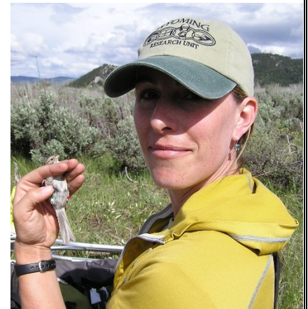
A CRU scientist holds a rare Brewer's sparrow.

CRU scientists are employing landscape genetics to develop more effective and efficient sampling and surveillance strategies for Chronic Wasting Disease (CWD). CRU scientists are investigating the relative importance of alternative environmental sources of CWD that function as important reservoirs for infection in deer or other domestic animals that contact these reservoirs. CRU researchers are studying radio-tagged northern long-eared and endangered Indiana bats to provide information on population responses to White-Nose Syndrome.