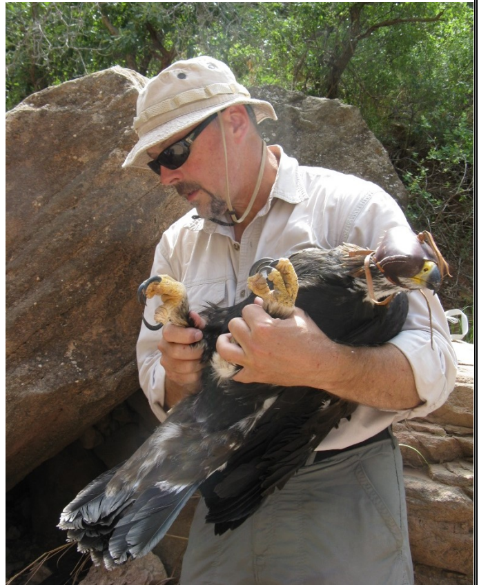
A CRU scientist holds an eagle for banding.

In order to achieve the needs of the existing CRUs, support existing conservation partnerships, and meet the research needs to address state and federal management responsibilities, the current CRU base funding of $17.3 million needs to be increased by $6.6 million to fill the current 36 CRU vacancies, address uncontrolled costs that continue to erode the CRU's cooperative capacity, and to fund longstanding, new CRU requests in IN, KY, MI and NV.