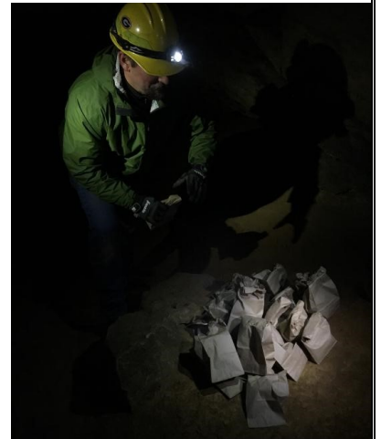
A CRU scientist studies rare Indiana bats

The economic, environmental, and health-related costs of invasive species exceed those of all other natural disasters combined. CRU scientists work across the Nation with federal and State management agencies to develop identification and response measures. CRU scientists are developing a decision analysis tool for control of New Zealand mudsnails that can be applied in Federal and State fish hatcheries. CRU scientists are working to suppress invasive lake trout in Yellowstone Lake and identify threats posed by invasive smallmouth bass in Yellowstone River. CRU scientists were part of the first responders when zebra mussels were discovered in two Montana reservoirs. CRU scientists are helping the National Park Service develop a control and eradication plan for invasive Asian swamp eels in the Chattahoochee River National Recreation Area. CRU scientists are assisting the Department of Defense in developing management methods to control wild burro populations at Fort Irwin.